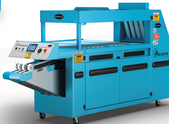
Triple Sort Model