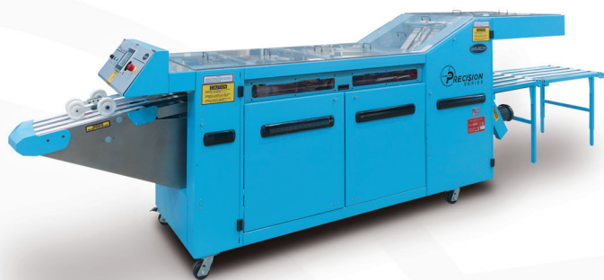
Rear Discharge Model