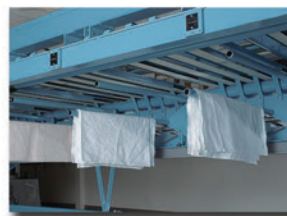
5 Lane Small Piece Visa® Accumulator