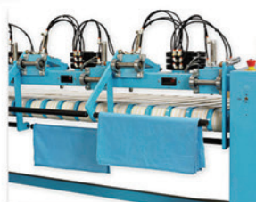
Small Piece Rotary Accumulator Available in 4 or 5 lane configurations.

The Braun (optional) 4 or 5 lane small-piece accumulators operate as an integral part of a primary folder or Folder/Cross-Folder. By using a multiple drape collection system, the system collects small items in preprogrammed bundle counts, allowing one operator to collect items processed by all lanes.